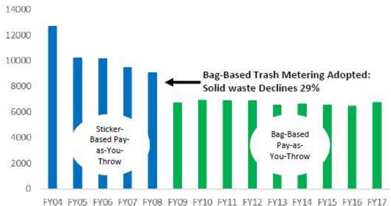
GLOUCESTER, MA. SOLID WASTE TONNAGE, FY2004-FY2017

Gloucester has saved more than a million dollars in disposal fees that they would have spent over those five years if the stickers were still in place